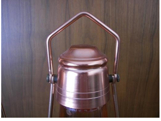
Matte Finish base