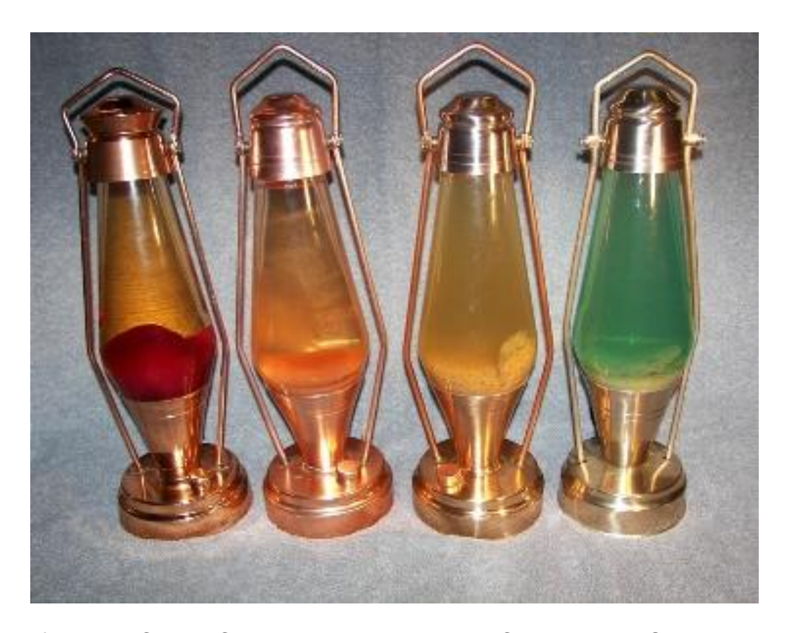
Left to right: Copper Coach Lantern, Matte Finish Coach lantern, Semi-copper Coach lantern, Brass Coach Lantern (Some uncertainty exists as to the proper chronological order of the Matte Finish and Semi-copper lamps).

Here's a picture of all 4 of the basic vintage Coach Lantern models: