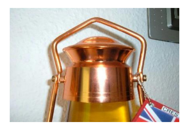
Early UK version (note the slotted screws that hold the bail wires to the top).