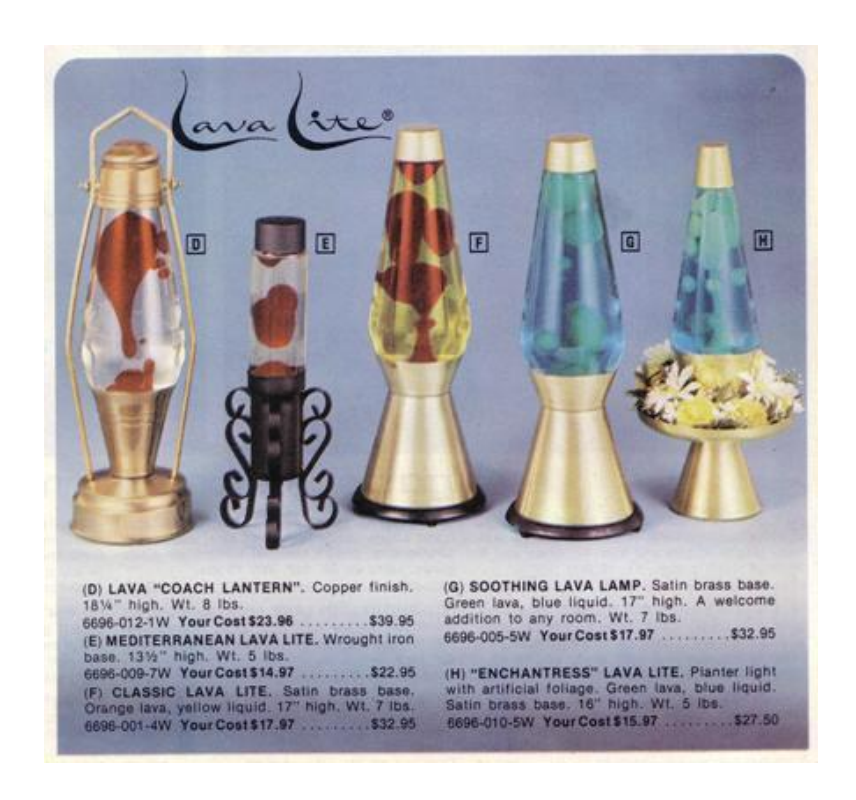
1976 State Jewelers catalog ad