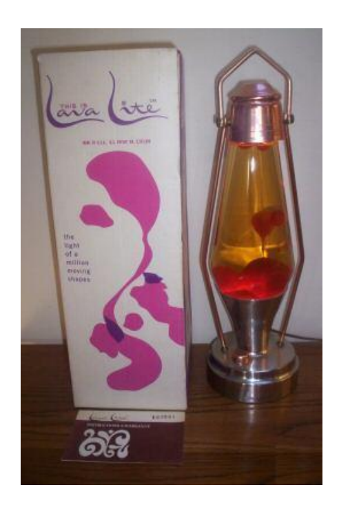
Semi-copper lamp with the tall copper colored top